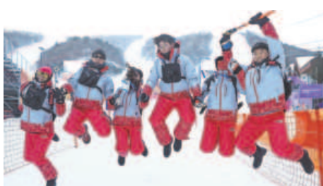
Volunteers enjoy themselves after the women's giant slalom was postponed because of strong winds last week.