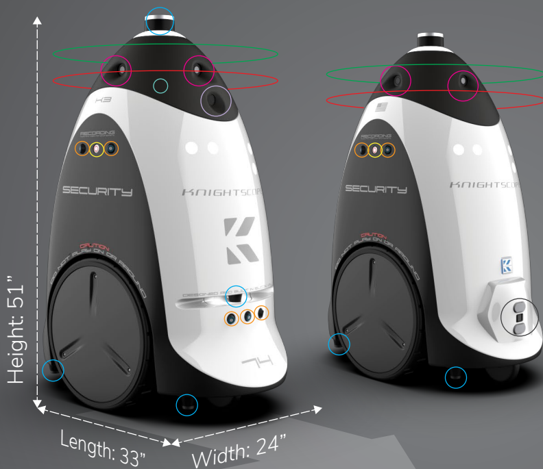
Speed: Up to 3 mph. Weight: 340 lbs.